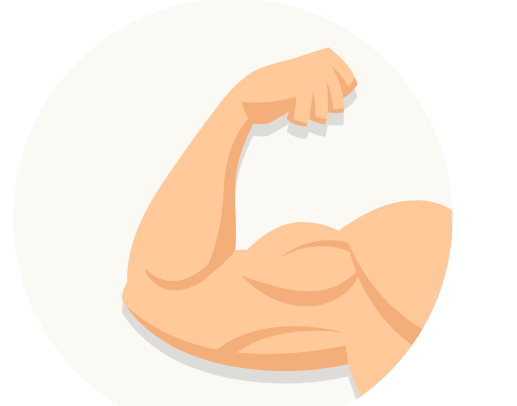
Create an Independent Learner